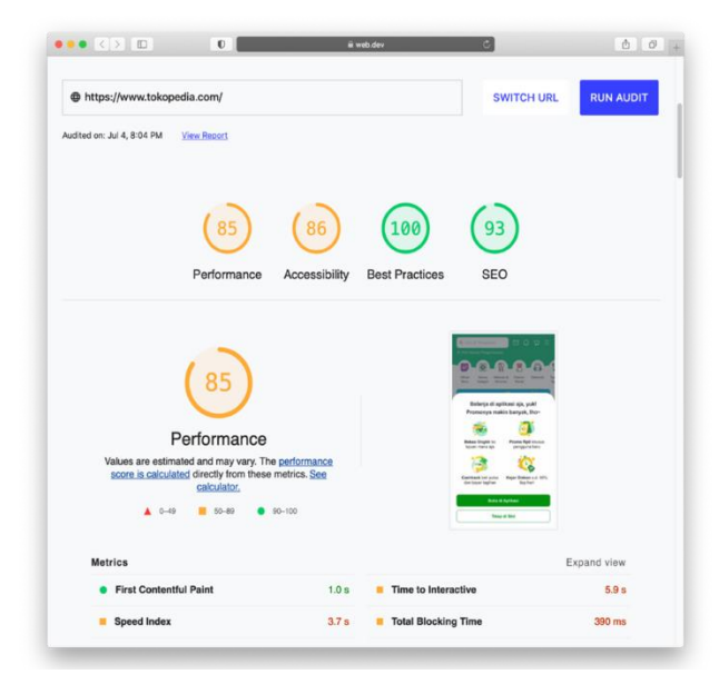
Fig. 2: Tokopedia Audit Results

Based on the data collection that was obtained on July 4, 2022, the analysis and testing are continued with the scan results that have been obtained using Google Lighthouse data obtained: