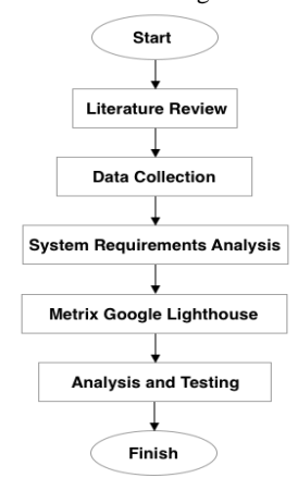
Fig. 1: Research Flowchart

Before conducting the research, the research steps applied can be seen in Figure 1 below: